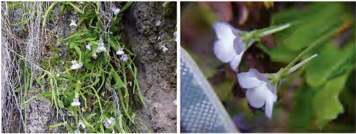
Figure 3: Pinguicula vallisneriifolia in the Sierra de Alhama (left); P. vallisneriifolia , Sierra de Segura (right).